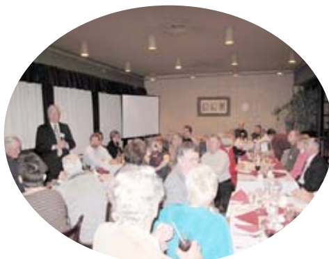
Conference dinner

In my opinion, the workshops were very good to excellent. The accommodations and food were also very good. The business meeting lasted just over 2 hours and it was a success too. As always, the best part was to be among such warm, caring and interesting people; old friends and new friends. The officiants group really does exemplify humanism and what it means to be humanists.